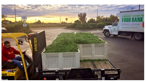
Freshly picked green beans, donated by Ruddenklau Farms for YCAP distribution

need of shelf-stable items to fill the cupboards during the cold winter months ahead. Our shelves are currently empty of many essential products, including hearty soups and chili, peanut butter, canned tuna and meats, beans, pasta and canned