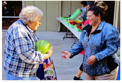
Volunteers distribute fresh, high quality produce at the McMinnville Senior Center

As the summer growing season comes to an end, our clients have let us know how very grateful they are for YCAP's fresh produce program, Harvest2Home (H2H). Every single week the program has successfully distributed thousands of pounds of fresh fruit and vegetables to neighborhood distribution sites and meal centers throughout Yamhill County, including our largest site at the McMinnville Senior Center.