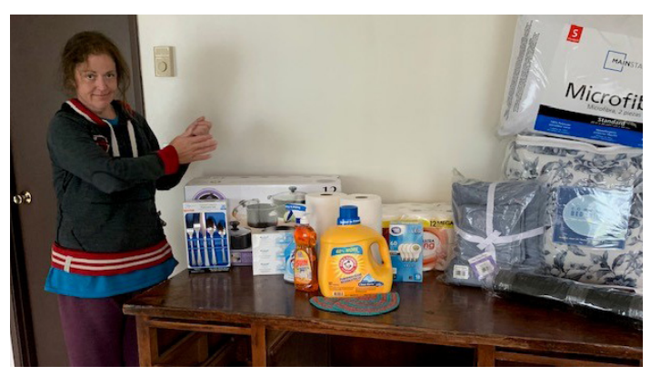
A YCAP client and recent graduate of our Rent Well program receives a "Street to Home" supply kit and keys to her very own apartment.

This past year, the YCAP Client Services and Housing Department was excited to add an innovative new program to our continuum of existing housing and homelessness services. The project is a supportive housing program for persons who are medically fragile and experiencing homelessness. In response to a rising trend of individuals with serious medical issues being encountered by the YCAP Client Services and Housing team, this housing